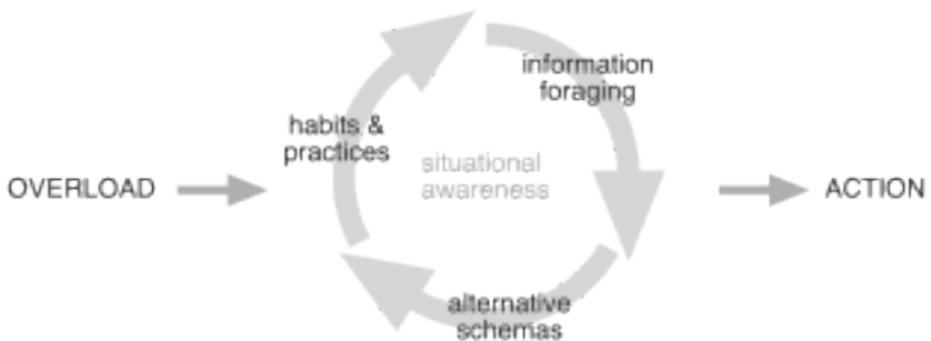
Fig. 3. Foraging as an attention practice, possibly amid sensemaking processes, with shifting frames of reference, and as a part of situational awareness.

Especially in mobile activities, sensemaking may also be understood as an application of foraging [figure 3]. Spatial abilities tend to readjust constructs constantly in response to situations; spatial mental models are seldom singular, metric, or disconnected from action. Instead, the workings of attention shift frames of reference to recombine components of knowledge representations with components of less articulated cognition of current environment. They also shift among form and media in the environment, and among patches of scope-giving circumstances. As is often the case, foraging occurs as a part of other activities, that give it purpose. One does not intend to forage; instead the process occurs amid other intentions, and sometimes shifts those intentions.