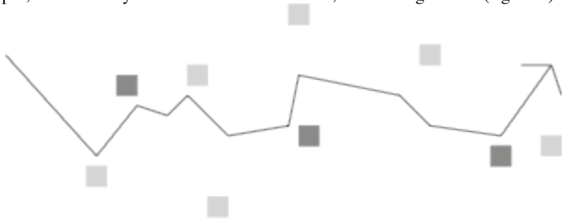
Fig. 1. Foraging involves unplanned movement among proximate patches of relatively rewarding information. These patches may be physical areas, co-present media, immediate social con-texts, or any combination of these. This process works especially well when moving about, as on a walk.

This does not mean that switching among stimuli always detracts, however. For when using many different kinds of information, some of them intrinsically embodied in context, their differences might just reinforce one task. Whereas too much consideration thus goes to multitasking, and too little to the use of multiple information channels for ongoing particular intents. This effect seems welcome, for example, amid activity also done for its own sake, like talking a walk (figure 1).