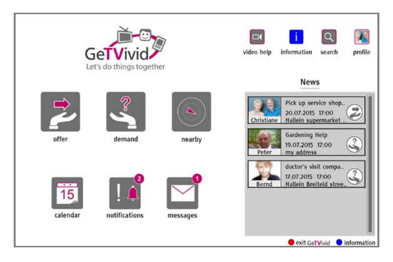
Fig. 2. Start screen on the TV providing access to the most important functionalities.

entering a new one on the platform. Additionally when specifying the offer/request, users can decide 1) if they want to have a fixed date or make it indefinitely available, 2) where it should take place, or 3) who should see it in terms of selective information sharing. These are important aspects in order to support the expectations of the provider and receiver. When accepting an offer or request a negotiation process will be started, in order to come to an agreement and support equal expectations. Additionally, profiling algorithms will alert the community manager in case of unfulfilled requests or one-directional support activities, in order to foster balanced relationships and, in the best case, reciprocal relationships.