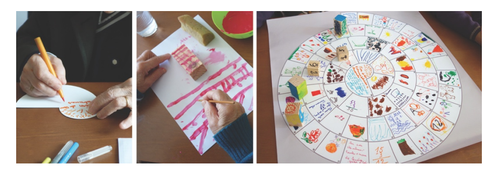
Fig. 3 Drawing, painting the playing pieces and final outcome of board game in the nursing home.

The activity of making this board game together was adapted to the intergenerational sessions of the nursing home António Almeida Costa. Since there was no aim to offer it to the families, a bigger board was created to be played in the institution. A big blank board frame was previously printed and used to help present the game idea. In order to increase the level of participation in codesigning the game, annual events were discussed and selected together with the participants. Cut-outs of each individual stop were prepared earlier so that participants could draw directly on them. These were pasted on the board at the end, so that the participants could have a more tangible sense of the development of the game. During two sessions, people with dementia and little children taking part in the sessions contributed with drawings according to the list of activities, but with no constraints about the use of colour. In a third session, participants were asked to paint the playing pieces (wooden blocks) (Fig. 3).