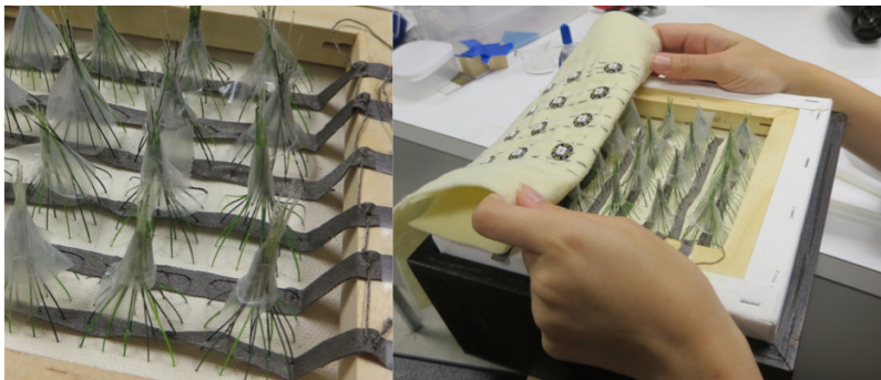
Figure 5. LED implementation for Grass

Interactive visualizations of Flora Touch were created using Processing [20]. They focused on visualizing invisible energy fields and the relationship with humans.