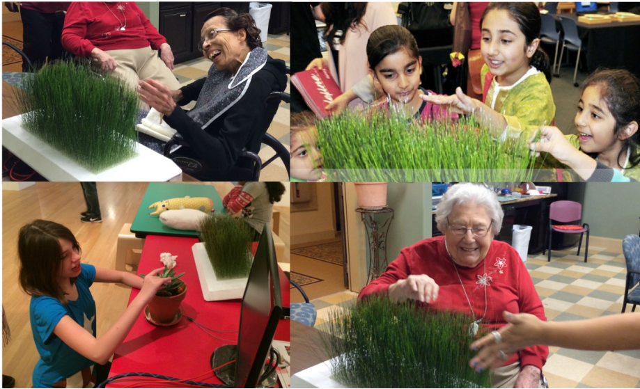
Figure 6. Participants Interactions with Touchology