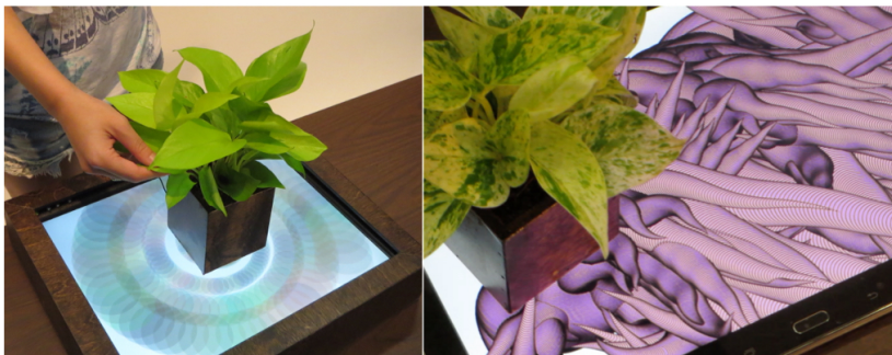
Figure 1. Interaction of Flora Touch

We carefully chose plants based on scientific evidence, aesthetic qualities and our initial observations. We aim for the level of touch to be not only beneficial to humans as it generates soothing feelings, but also to plants development as well. Researchers found gently rubbing leaves or caressing plants between the thumb and forefinger can trigger plant defense system and can gradually become more resistant to various pathogens [17]. In this paper, we will introduce two small projects ( Flora Touch and Grass ) of Touchology .