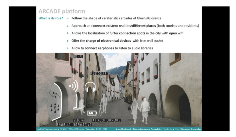
Fig. 3. The arcade platform proposed by PoliTo Team, an integrated urban service to charge electronic devices, to connect earphones, to connect tourist and residents by market place means.

Together with the Vice Major and other local stakeholders, it was possible to recognize a spatial engagement of citizens to the historic qualities of their center, of their agricultural habits and time routines, and of the retail connection to daily social activities.