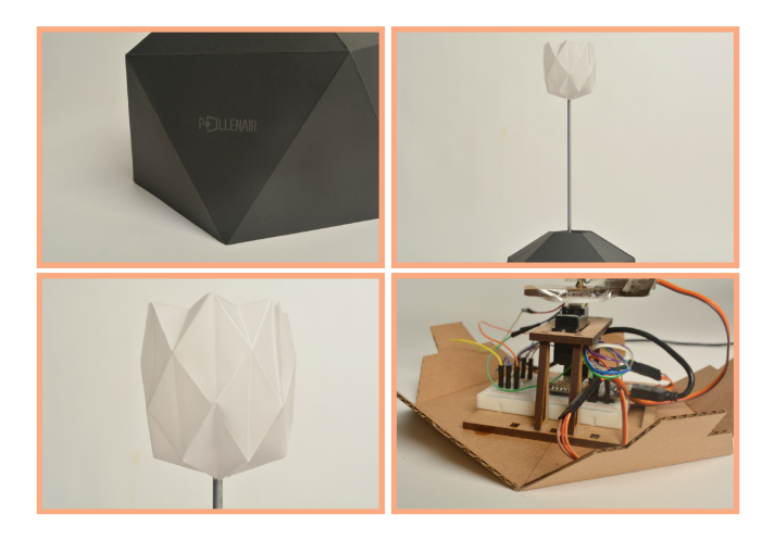
Fig. 6. The Pollenair prototype

colour of the flower. The prototype was developed by using a NodeMCU WiFi board for the acquisition and processing of the real-time data, and for controlling the LEDs and two micro servo-motors used for bending the flower (Fig. 6). Finally, the external structure was manufactured using mainly the laser cutting technology for the basis (made of Plywood, 5mm), while a 3D printing machine was used for manufacturing the main shape of the flower.