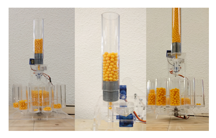
Fig. 7. The working prototype of the Budgy

The physical structure was manufactured by using mainly the laser cutting technology for the flat sides (with Clear PMMA, 3mm), while a 3D printing machine was used for manufacturing the valve, leverages and gear wheels (Fig. 7).