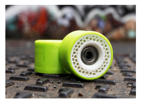
Fig. 3. "Sprinted Wheel" by Carlo Maestri, Alice Mastropasqua, Dario Panico. Dimensions: 52 x 52 x 42 mm, Materials: ABS e Filaflex, 3D printing technology: Double extrusion Fused Deposition Material (FDM)

The two best projects are described below.