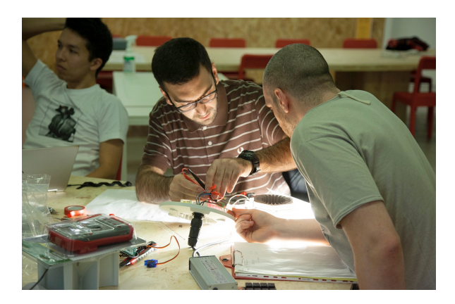
Fig. 2. Students working during the "Design From Ideas To Market" hackathon

The first "stress test" to check the scientific-technical and operational model of Polifactory has been the project called "From Ideas to Market" funded by Regione Lombardia, which allowed the final technological setting of the Lab. The project aimed to simulate and demonstrate how the makerspace can work. A hackathon on interactive furniture has been organized in the new makerspace involving 3 companies and 15 among designers, architects and engineers. The Polifactory scientific team collaborated with 3 companies – Manerba, LuxSolar and Mobilitaly consortium – to define specific design challenges (interactive lighting, interactive living rooms and smart office) and asking them to donate three products (a sofa, a desk and a light) to be hacked by the participants in order to develop new interactive furniture products. The three new interactive prototypes developed during the three days of the hackathon have been presented at the European Maker Faire in Rome in 2015.