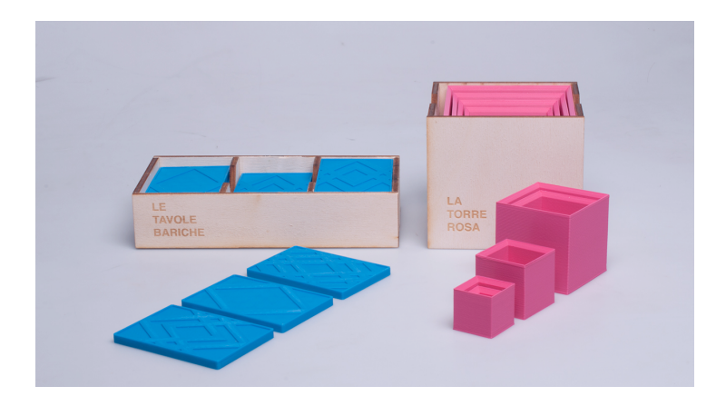
Fig. 5. Prototype of the learning tools for the Montessori Method.

The method uses various wooden objects such as, for example, cubes of different sizes, wooden prisms of variable thickness, bars that differ in length, small coloured tablets - for the associations and combinations of colours -, geometric solids, bidimensional geometric shapes, tablets with different degree of roughness, tablets with different weight to develop the baric sense, tablets with bas-relief letters so that children can become familiar with the letter shapes, instruments introducing mathematical concepts such as the Pythagorean theorem and many more.