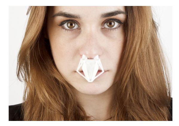
Fig. 4. "Traho" - nasal filter by Renato Ocone, Lucrezia Rescigno, Alice Scaringella. Dimensions: 39 x 22 x 44 mm, Materials: PA 3200, 3D printing technology: Selective Laser Sintering (SLS)

order to guarantee the best performance either to made trick or to run in a city with the maximum control of the skateboards, the three students printed lots of sample to define print direction, slicing parameters, and infill pattern and amount. The hexagonal texture in the inner part identifies Sprinted, between the competitors' wheels, as the unique wheel for skateboard produced by 3D print, and the perforated part guarantees a much lower weight than those currently available on the market.