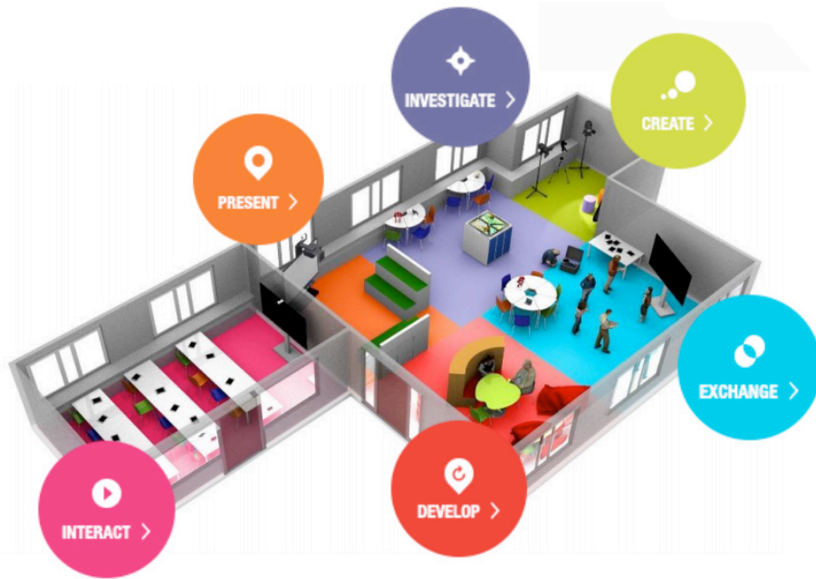
Fig. 2. FCL layout and learning zones [23]

that these spaces (figure 2) are distinct from traditional classroom and still quite recent (the first FCL created in Brussels, opened its doors in 2012).