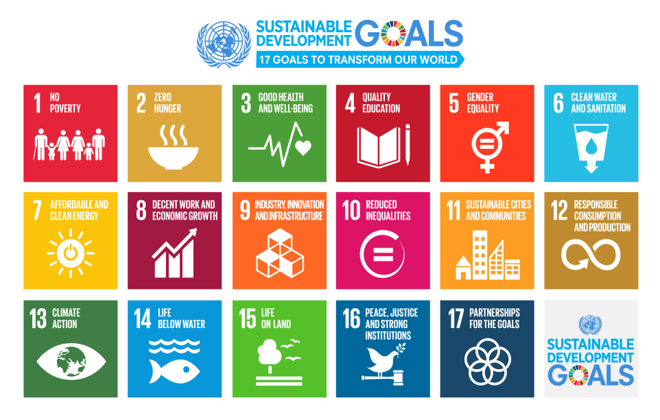
Fig. 1. United Nations Sustainable Development Goals

"Transforming our world: the 2030 Agenda for Sustainable Development" is the United Nations agenda for sustainable development. Adopted in 2015 by the UN General Assembly, it consists of a Declaration and a set of Sustainable Development Goals (SDGs). The Declaration refers to the contribution of ICT to sustainable development: "The spread of information and communications technology and global interconnectedness has great potential to accelerate human progress, to bridge the digital divide and to develop knowledge societies [...]" [13].