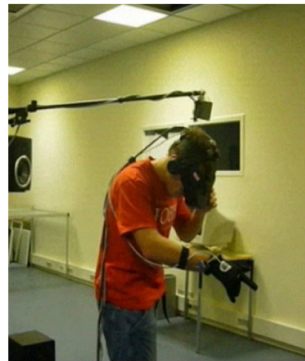
Figure 6: A subject interacting with the VR bowling game.

By building a virtual bowling game, the interdependency