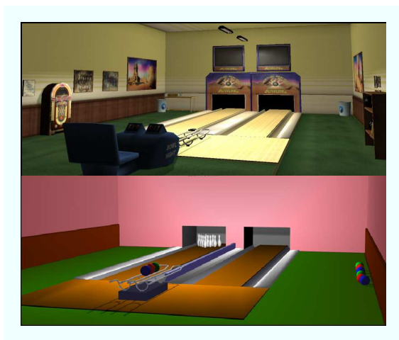
Figure 5: From the VR bowling game. Top: high quality visual display. Bottom: low quality visual display.

The virtual reality bowling game is a project developed during the 7th Semester (first semester of the Master education) in the Fall 2006, under the theme Merging of the senses which addresses the questions just described.