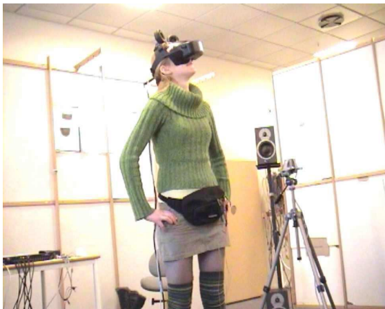
Figure 8: A subject during the experiment in self sound in VR.

140 subjects tried the six different auditory environments. The motion of the subjects was recorded for further analysis. Moreover, after visiting the environment subjects were asked to fill in a presence questionnaire. Such questionnaire was carefully designed by combining several established questionnaires in the field [26, 22, 25]. Quantitative results show that motion significantly increased when a dynamic soundscape and the self-sound of subjects' own footsteps was present in the environment. Moreover, analysis of the presence questionnaire's results showed that subjects reported a strong sense of presence in the dynamic auditory environment. This project won a prize at the Danish SigCHI student price competition for best Master thesis in Denmark 2006. More information related to this project can be found in [17].