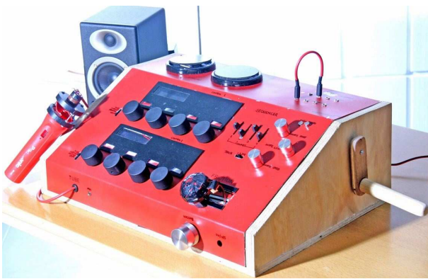
Figure 7: The final look and feel of the PHYSMISM was among other things inspired by old analogue synthesizers.

As can be seen in Figure 7, the PHYSMISM is a novel hardware interface in which several physical models are implemented. Among them, a friction model such as the one found in a bow exciting a string, an aerodynamic model like a person blowing into a flute, a stochastic model similar to the one simulating playing a maracas, and an impact model typical of percussion instruments are implemented.