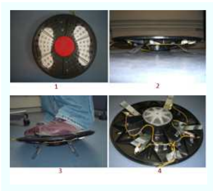
Figure 3: From the Wobble active project. 1 Top view, 2 side view, 3 wobble active in action, 4 the bottom.

A professional physiotherapist was also consulted, who was positive and enthusiastic about the possibility of using the enhanced Wobble board for training.