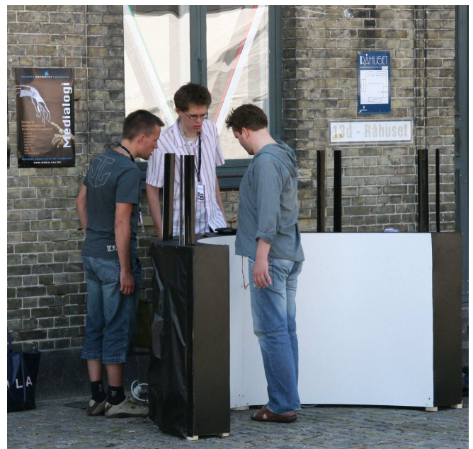
Figure 4: The Soundgrabber was publicly displayed at the Sound Days event in Copenhagen in June 2007.

Moreover, a bucket is placed in the center of the semi-circle. The user interacts with the Soundgrabber using a glove embedded with a bend sensor. By bending the hand inside the bucket, the user is able to grab a sound, listen to it (thanks to the speaker embedded inside the glove) and release it in one of the columns. The Soundgrabber is therefore an interactive installation where users can grab different sounds and place them in different locations.