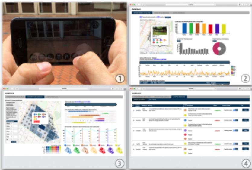
Fig. 3 – Collaborative Environment Interfaces: 1. Mobile Augmented Reality application, 2. General Status of the Zone, 3. Block Status, 4. Generated Alerts

For the creation of the interactive visualizations that are part of the collaborative environment, we relied on the search mantra of visual information defined by B. Shneiderman [23]: “Overview first, zoom and filter, then details on demand”: This means that, at the beginning, the user gives a general look at the interface in order to understand what is being shown to him and how it works. Then, he focuses on the section that called his attention. He refines his search with the available filters, and finally, he looks at the details of the information to verify if it was what he was looking for.