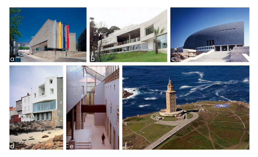
Fig. 2. Architecture in A Coruña and its surroundings. (a) Centro Gallego de Arte Contemporáneo by Álvaro Siza. (b) Facultad de Fisioterapia by Manuel de las Casas. (c) Domus by Arata Isozaki. (d) Casa de Corrubedo by David Chipperfield. (e) Museo de Bellas Artes da Coruña by Manuel Gallego. (f) Tower of Hércules.