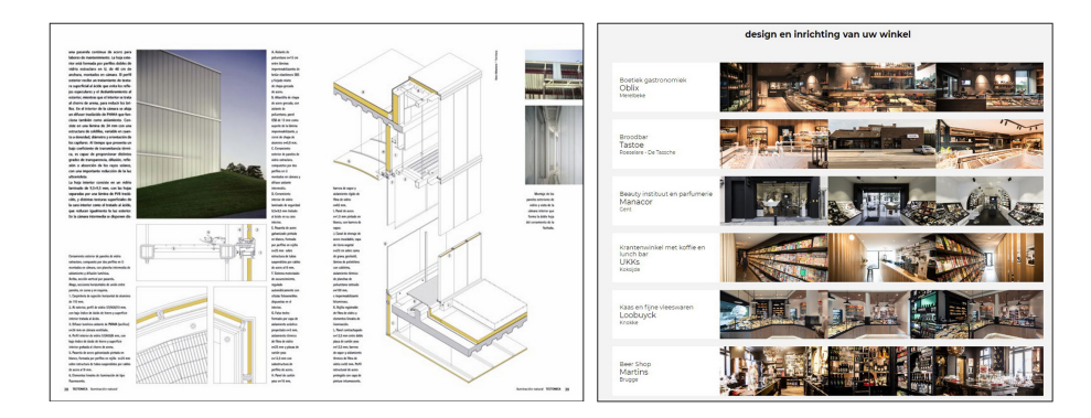
Fig. 1. Left pic: magazine example that combines different graphical representation and text. Right pic: website example based on shocking photographs.

Digital architectural information is usually much more limited. The websites dedicated to architecture significantly simplify the information. The authors of blogs or specialised websites are highly selective about the information they provide. In general, these sources provide fewer descriptive plans, insufficient to define the building, but present a greater abundance of "shocking" photographs or renders (see Fig. 1). They rarely provide constructive details and, as a result of taking into account visual fatigue, the continuous changing of pages and a certain dispersion of attention, they provide many fewer texts, avoiding any in-depth explanation of the architectural work.