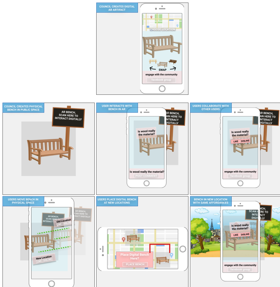
Fig. 2. Different possibilities of augmented reality participation

A council may be deciding where to place seating in a small public space. As an experiment, the council could place some seating in the space and lock this seating to a spatial anchor so that it is recognised as a digital object in an AR environment. This AR environment could be viewed by any citizen with an AR compatible device but could also be linked to a GPS system or a social media community. Through this device, a